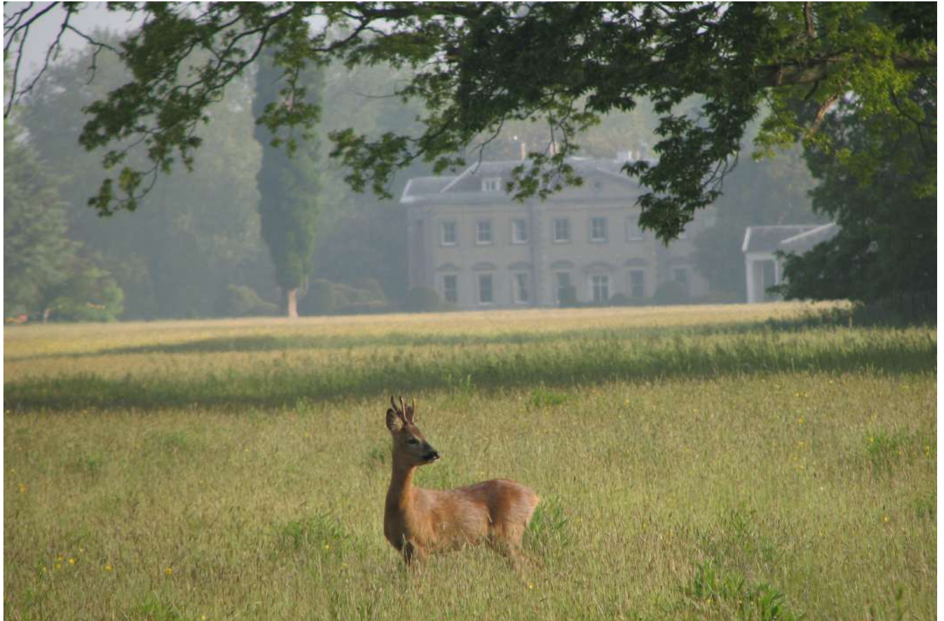
The Countess Mountbatten of Burma

My historic family home is a very special place that I hold dear, I am pleased to be able to host these very special occasions.